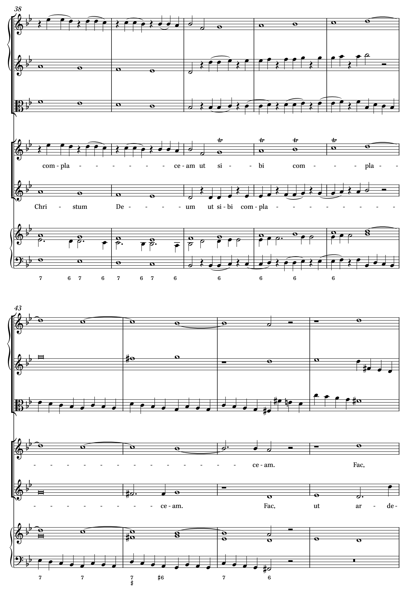
© 2017 Ben Byram-Wigfield. Free to print.