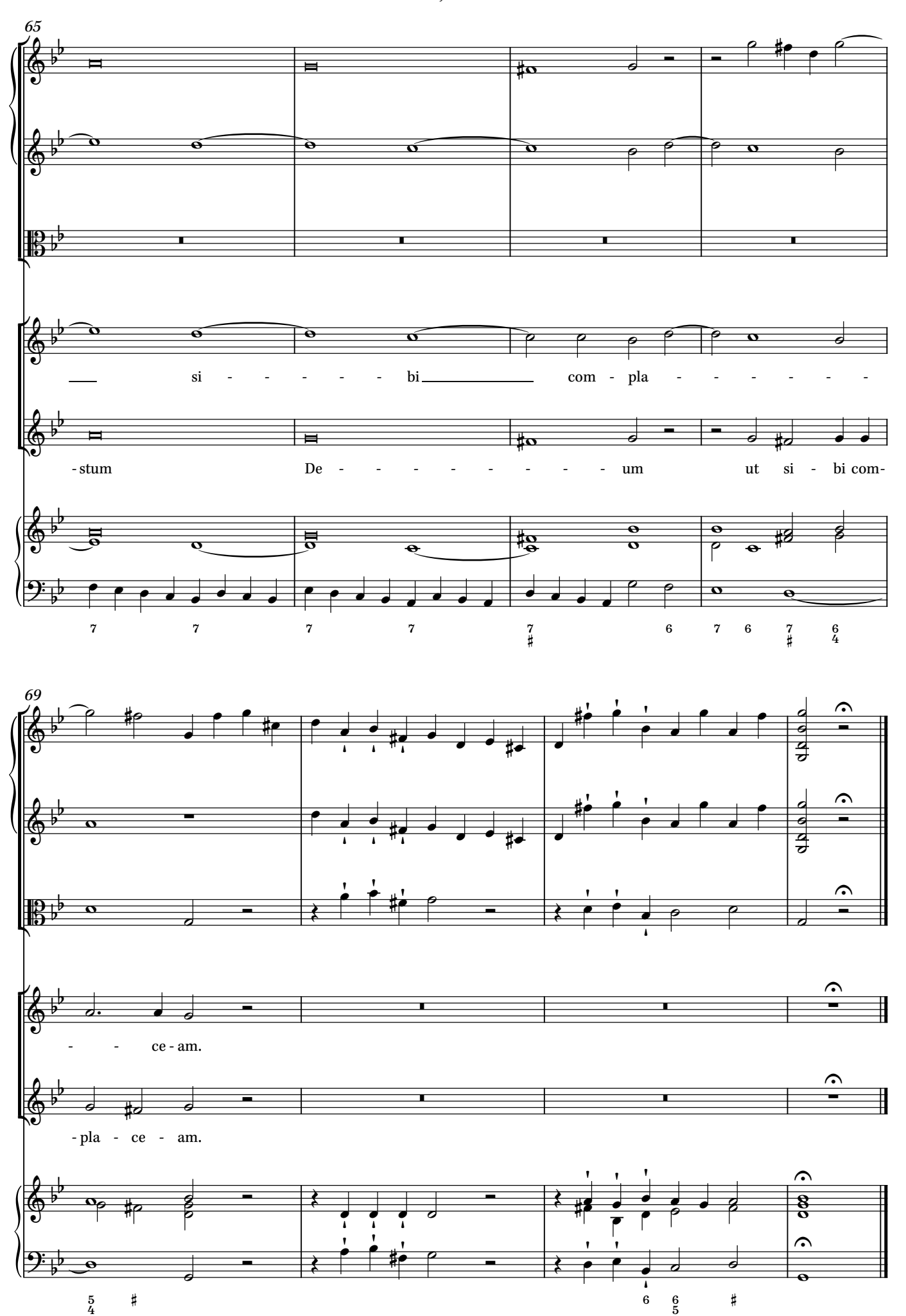
@ 2017 Ben Byram-Wigfield. Free to print.