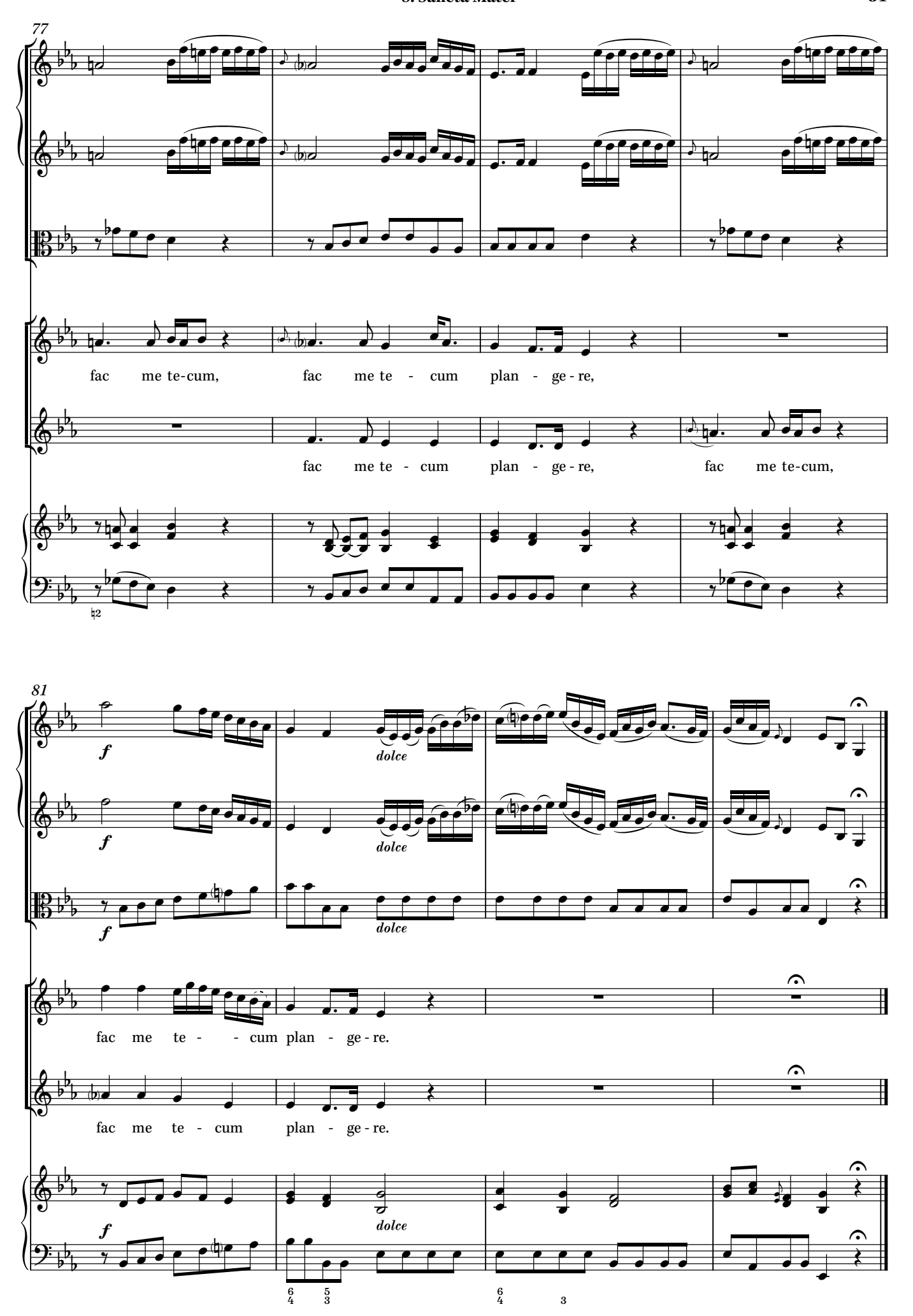
© 2017 Ben Byram-Wigfield. Free to print.