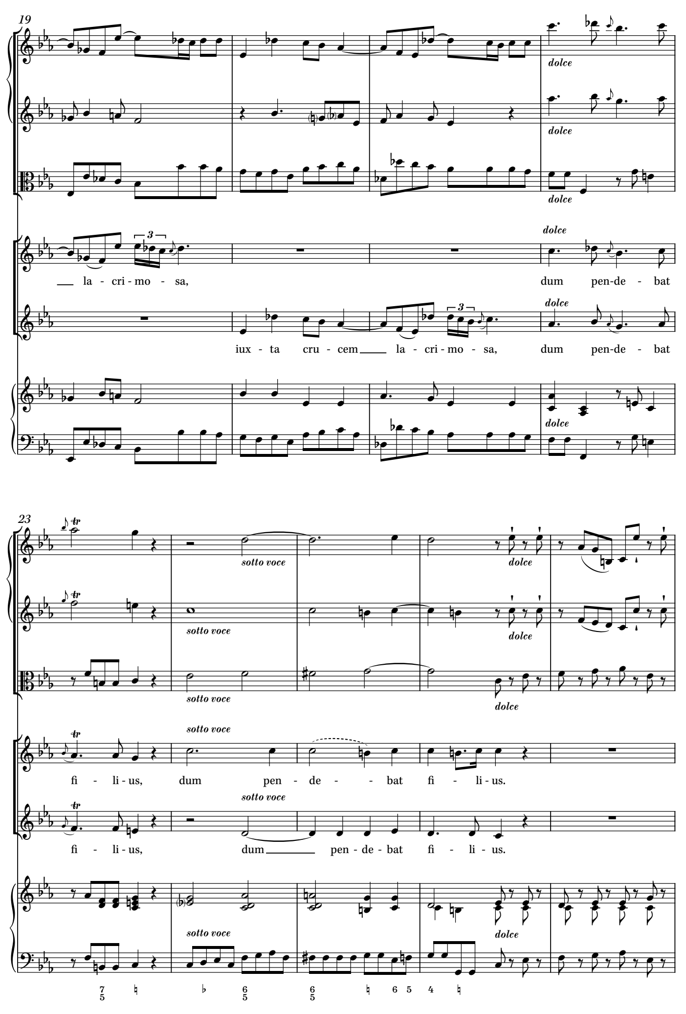
© 2017 Ben Byram-Wigfield. Free to print.