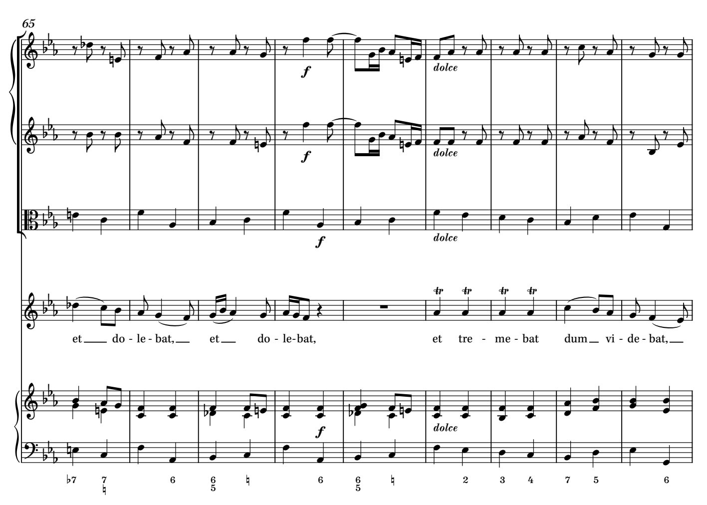
© 2017 Ben Byram-Wigfield. Free to print.