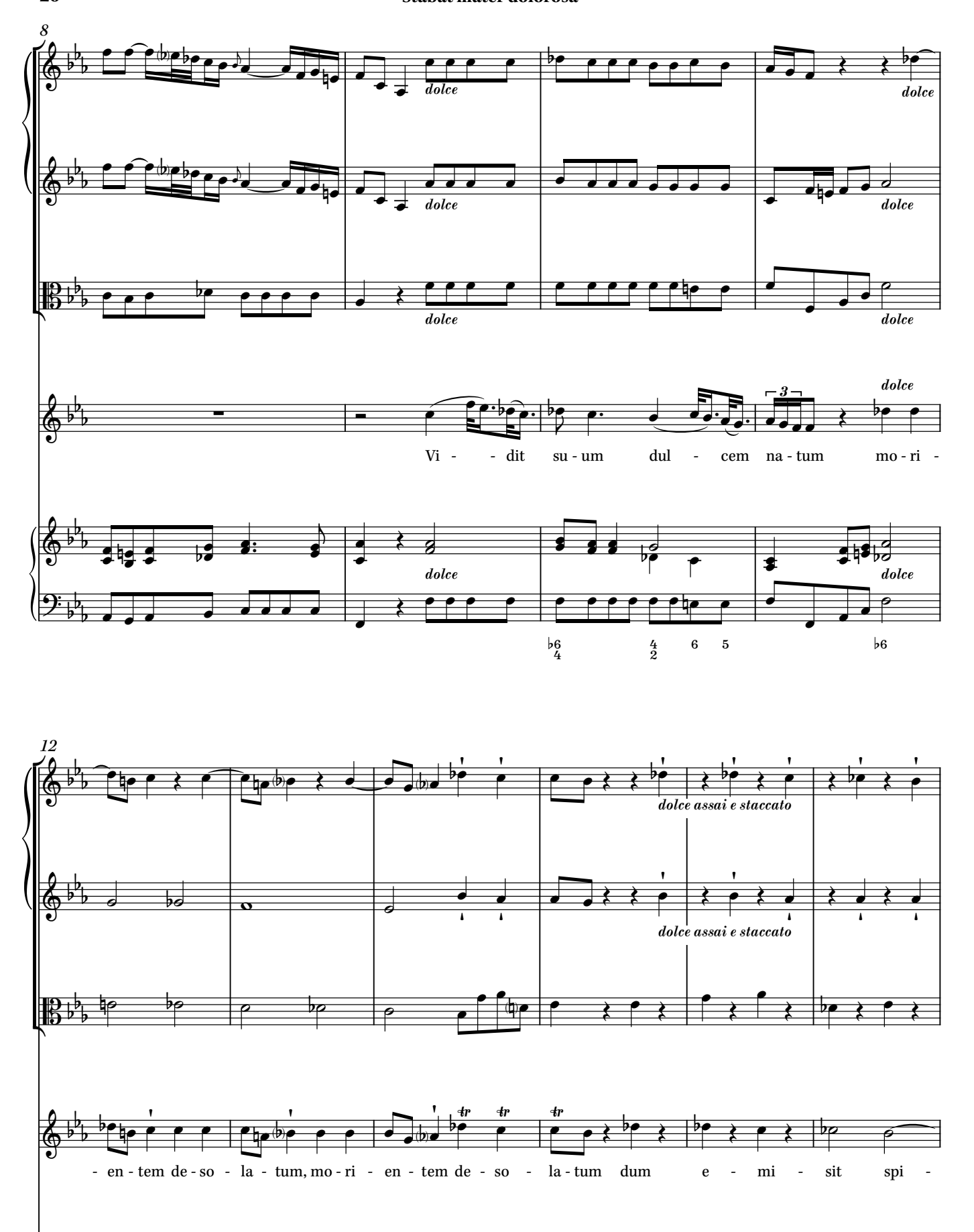
© 2017 Ben Byram-Wigfield. Free to print.