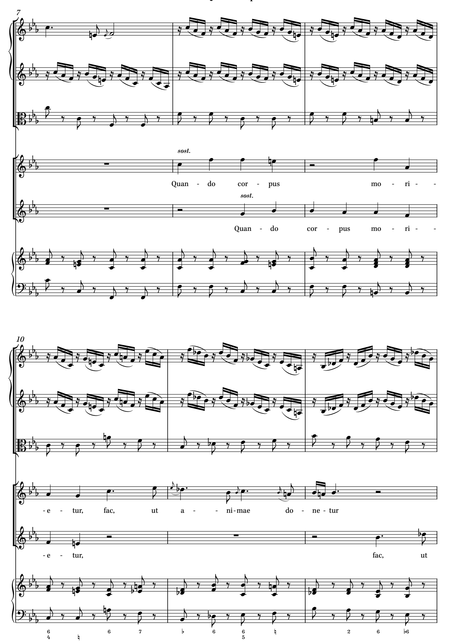
@ 2017 Ben Byram-Wigfield. Free to print.