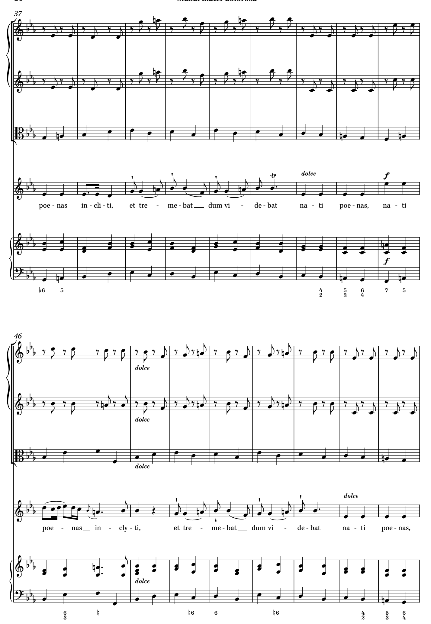
© 2017 Ben Byram-Wigfield. Free to print.