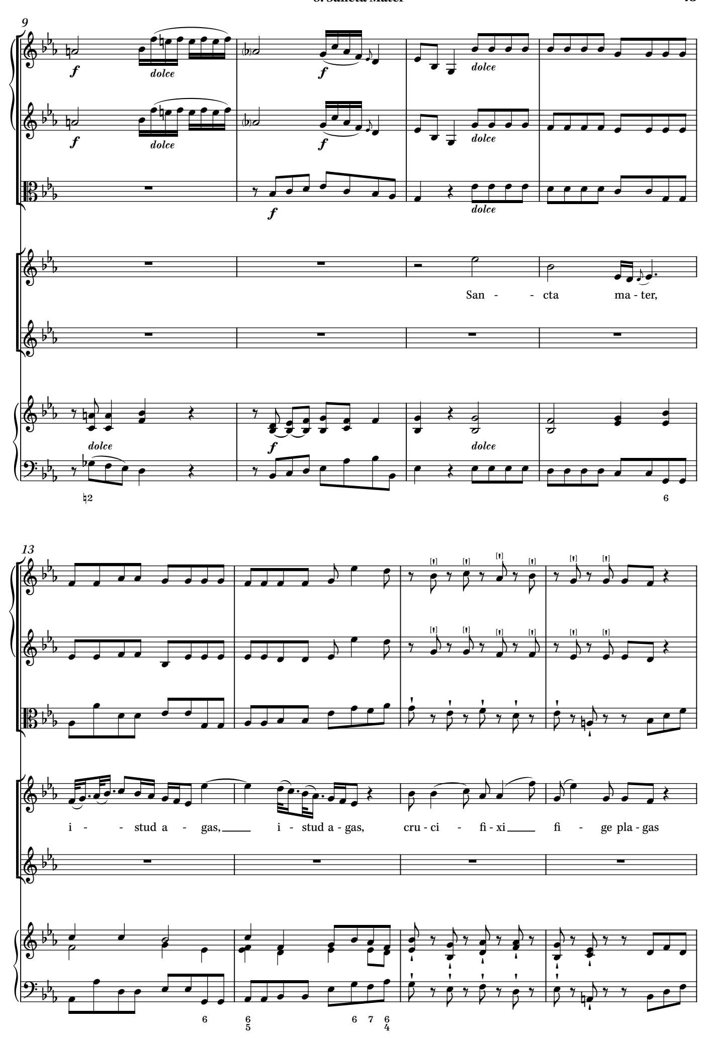
Free to print.