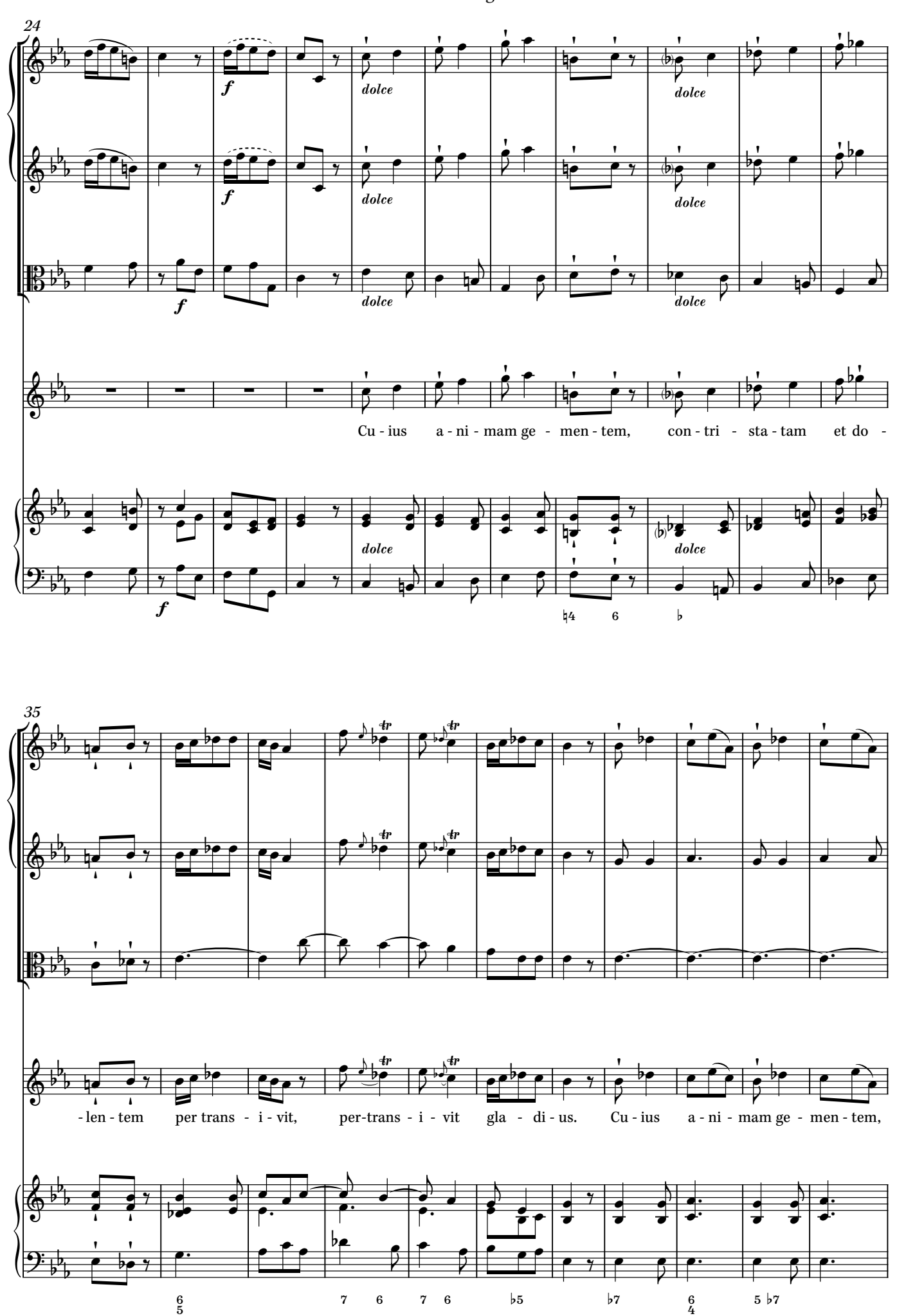
© 2017 Ben Byram-Wigfield. Free to print.