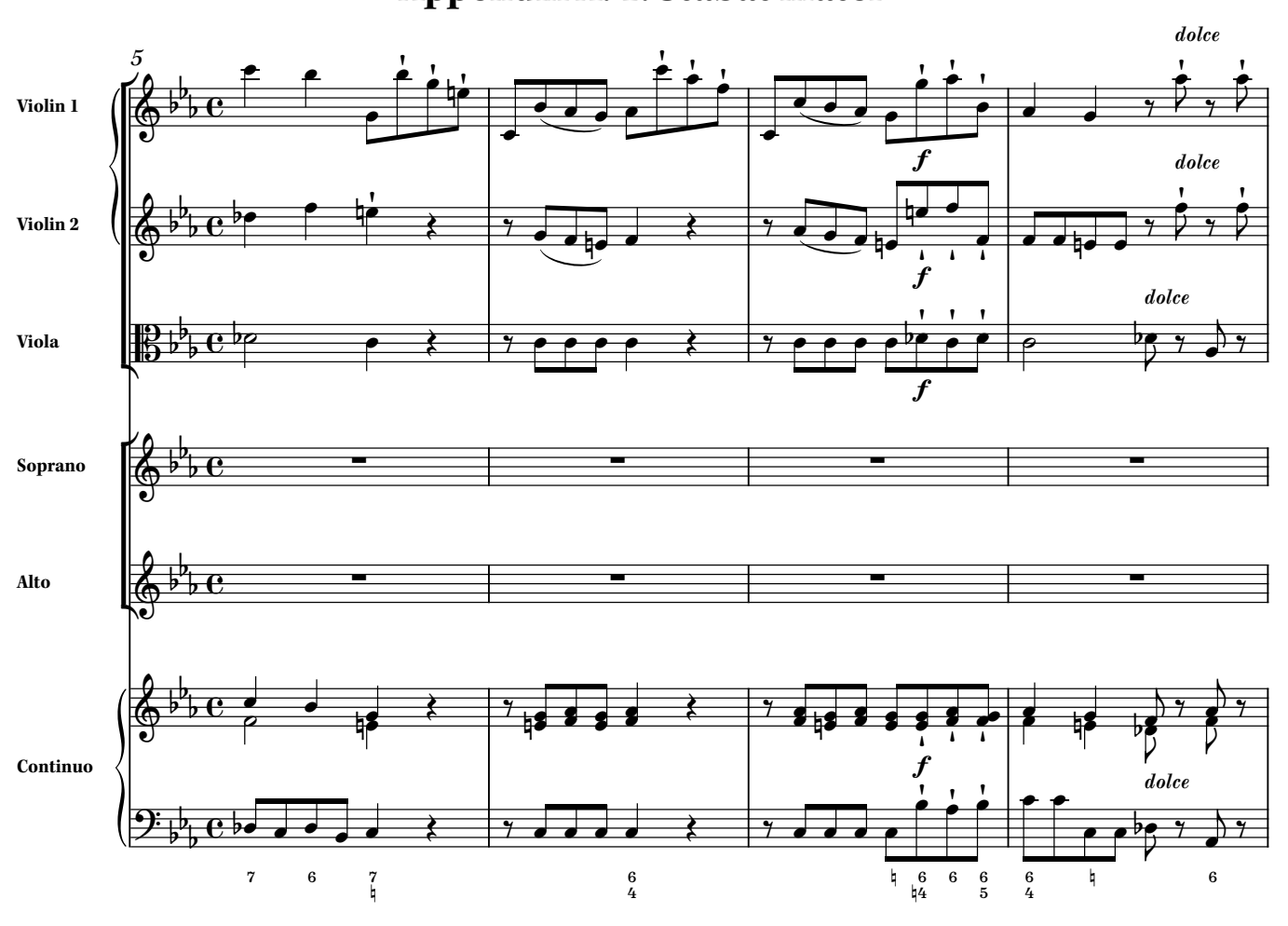
© 2017 Ben Byram-Wigfield. Free to print.