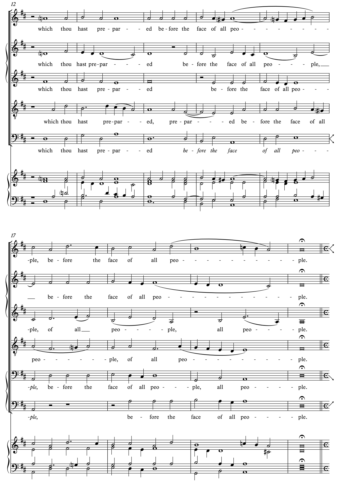
© 2025 Ben Byram-Wigfield. Free to print.