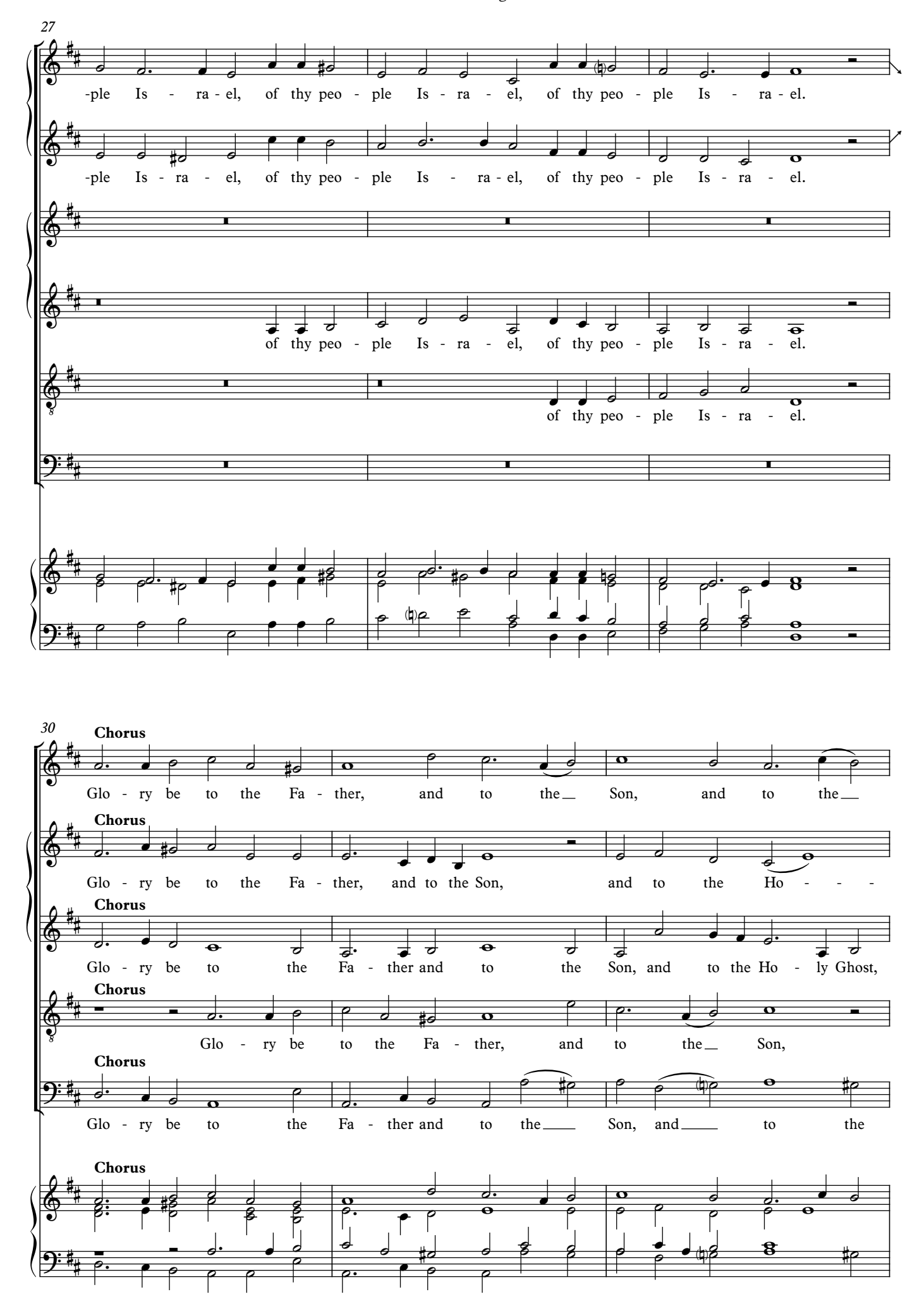
Free to print.