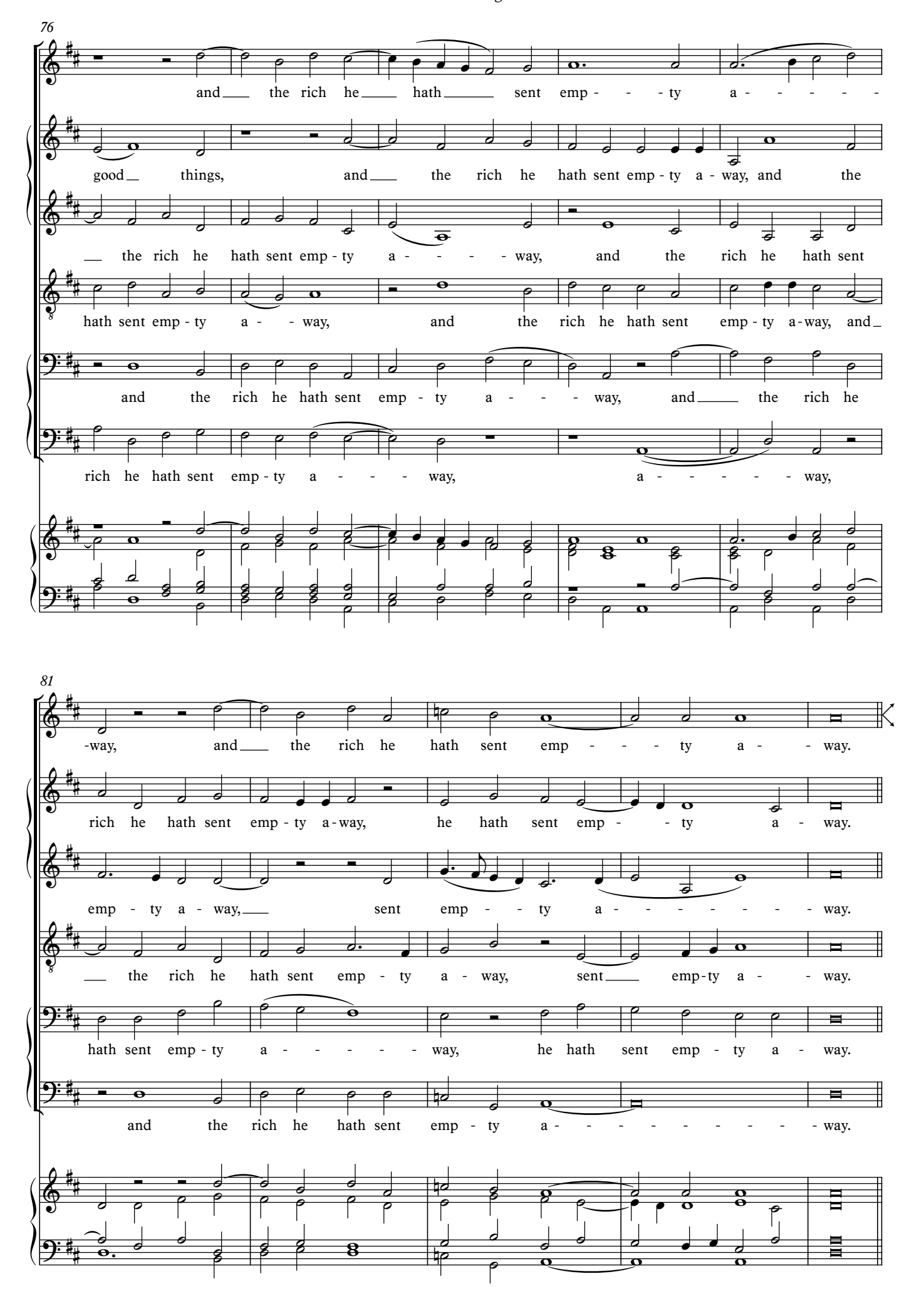
Free to print.