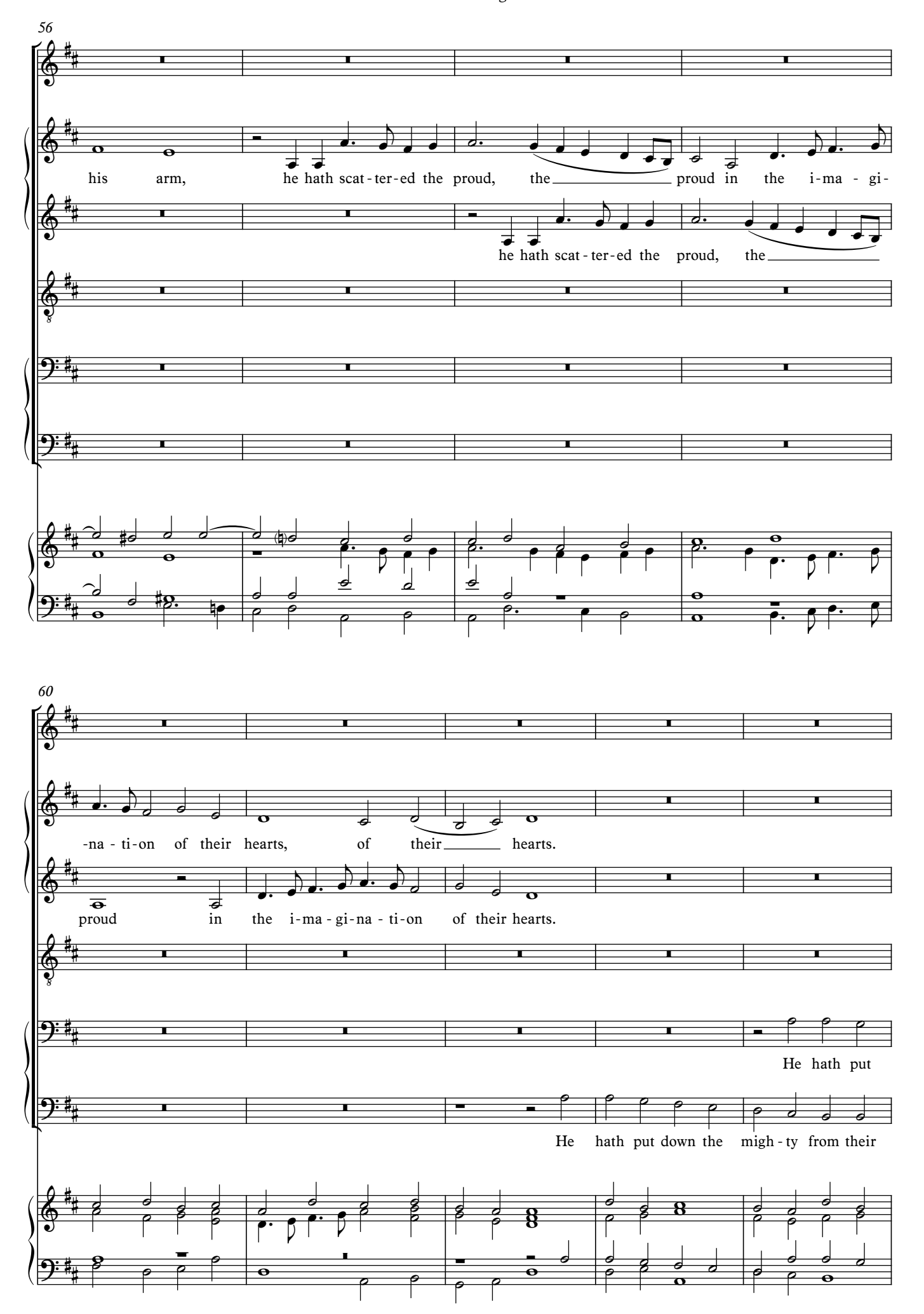
© 2025 Ben Byram-Wigfield. Free to print.